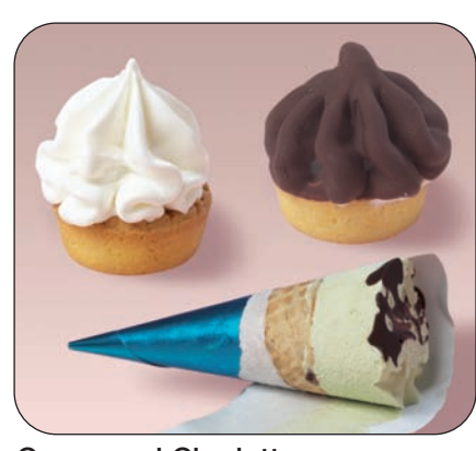
Cones and Charlottes